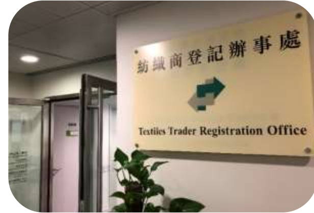
Textiles Trader Registration