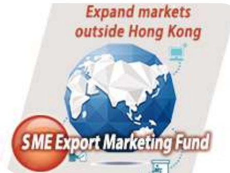
Financial Support for enterprises