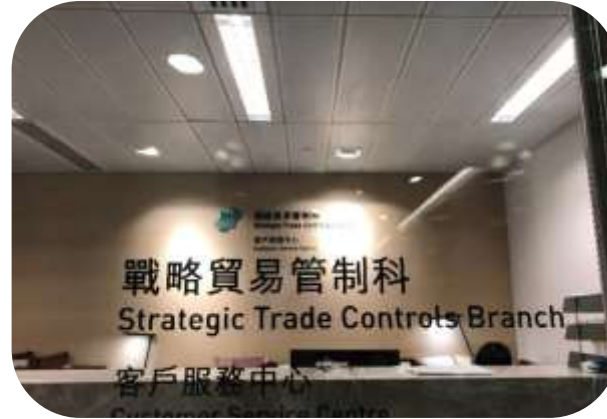
Strategic Trade Controls