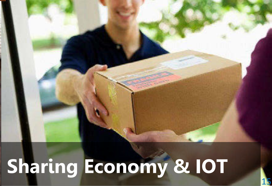
Sharing Economy & IOT