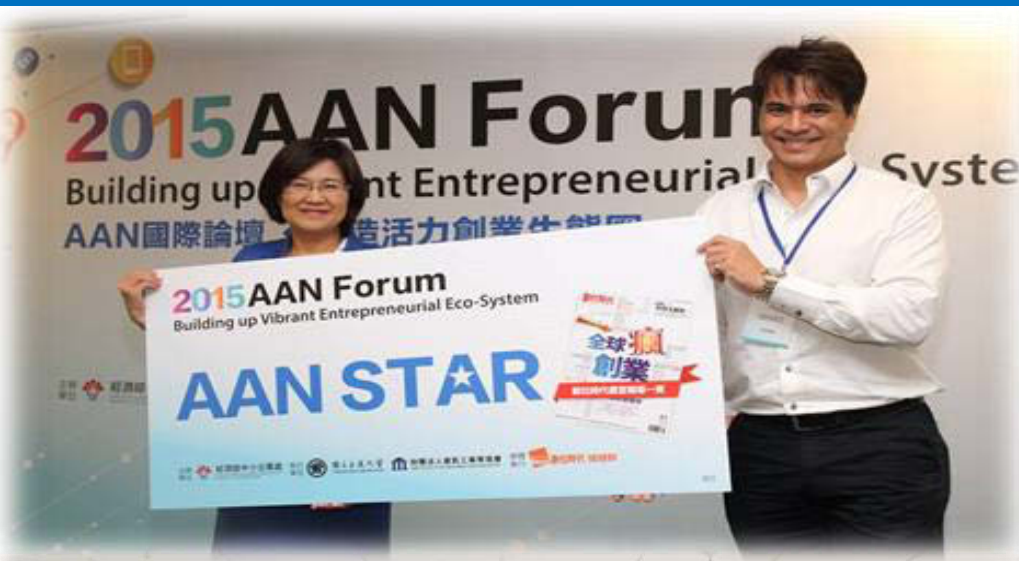
■ AAN Forum I, Atlanta, the United States